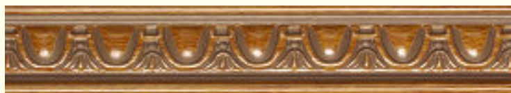
Egg & Dart - Golden Oak

Egg & Dart takes your conservatory back to its origins. The embossed design is reminiscent of the luxurious drawing rooms of Victorian and Georgian times – eras when conservatories first started to enjoy widespread popularity.