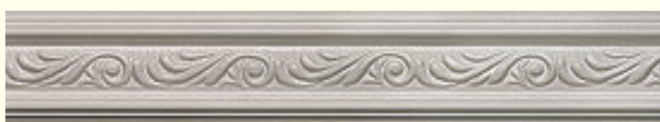
Floral - White

Your conservatory can give you a grandstand view of nature – and not just through the windows. Bring a sense of natural beauty into your favourite room with the addition of stylish and sophisticated Floral trims.